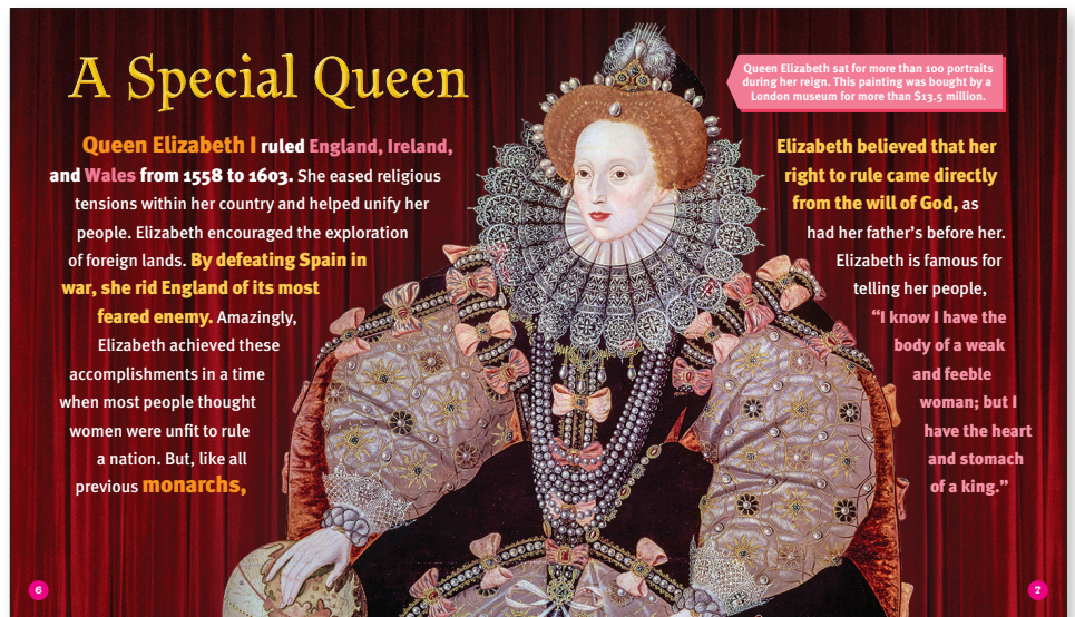
Sample spread from Elizabeth I